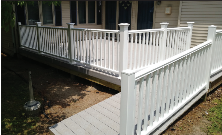
New deck at Catalina