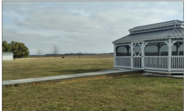
New sidewalk to the gazebo at Sandusky